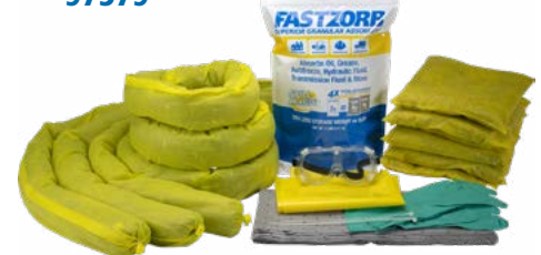
HAZMAT SPILL KIT REFILL