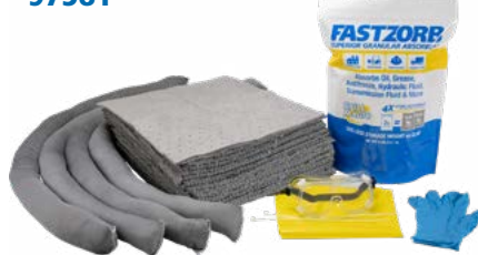
UNIVERSAL SPILL KIT REFILL