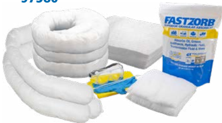
OIL SPILL KIT REFILL